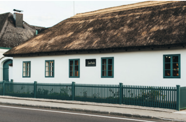
Haydn Geburtshaus Rohrau

SCHLOSS ROHRAU (ROHRAU CASTLE) Schloss 1 | 2471 Rohrau/Austria www.schloss-rohrau.at