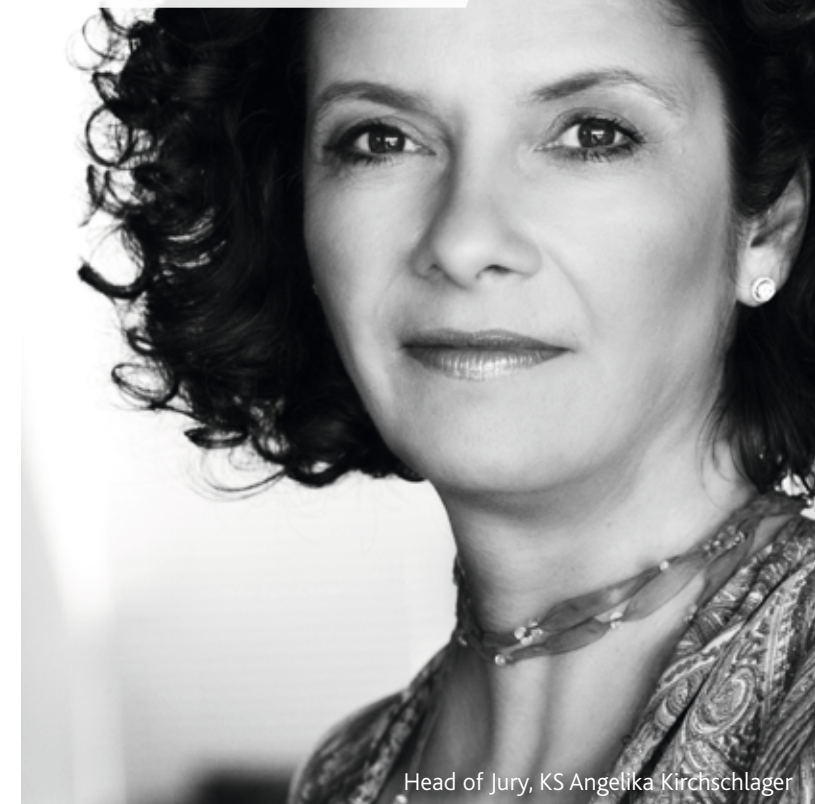
Head of Jury, KS Angelika Kirchschrager

REGION Zum Haydn NIEDERÖSTERREICH COMPETITION